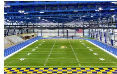
South Dakota State University Brookings, SD