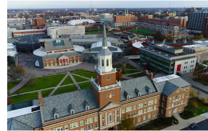
University of Cincinnati Cincinnati, OH