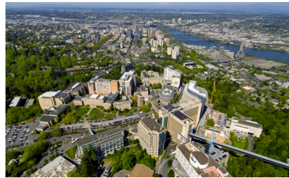
Oregon Health & Science University Portland, OR