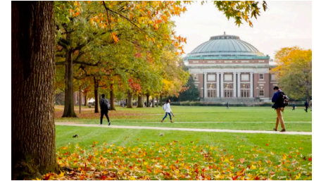
University of Illinois at Urbana Champaign Champaign, IL