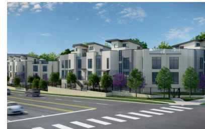
Kansas State University Foundation Manhattan, KS