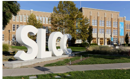
Salt Lake City Community College Salt Lake City, UT