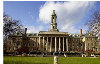
Pennsylvania State University University Park Erie PA