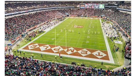
Temple University Philadelphia, PA