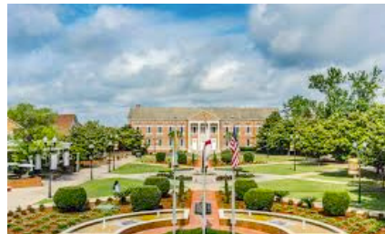
Florida A&M University Tallahassee, FL