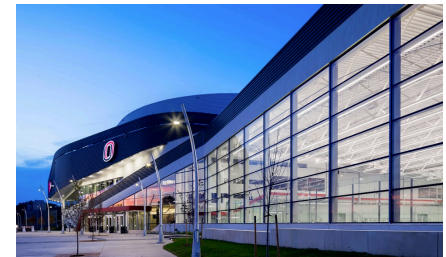
University of Nebraska at Omaha Omaha, NE