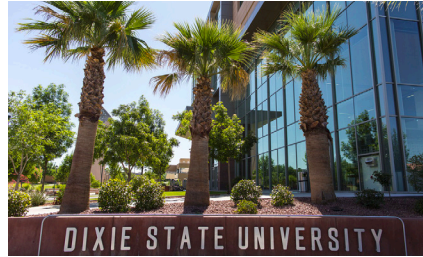
Dixie State University St. George, UT