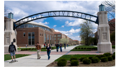
Purdue University Hammond, IN